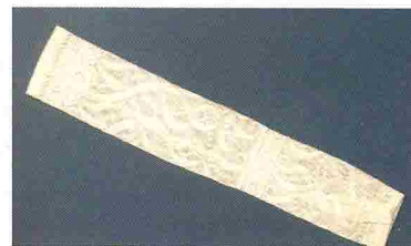
A ladies' cream silk knitted single mitten, 1905/10, 15 inches long, with an intertwining ribbon pattern. Made by W. Ball and Son, Ilkeston, Derbyshire. Past

A "get yourself there" event has been arranged to Dents glove factory in Warminster. There will be a talk about the factory and how the gloves are produced with a tour of their small museum which includes some of the coronation gloves made by them. Afterwards a tour to their factory shop is almost as informative.